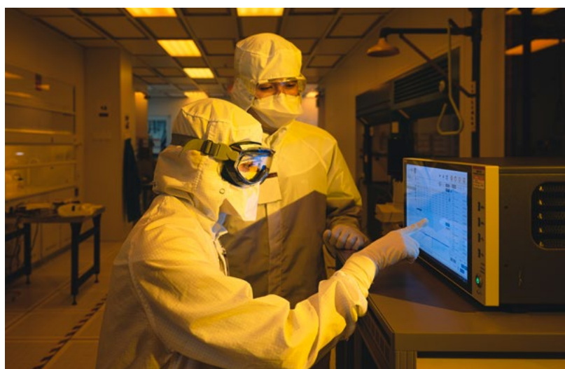
Mentoring in the educational bay of the Scifres cleanroom.