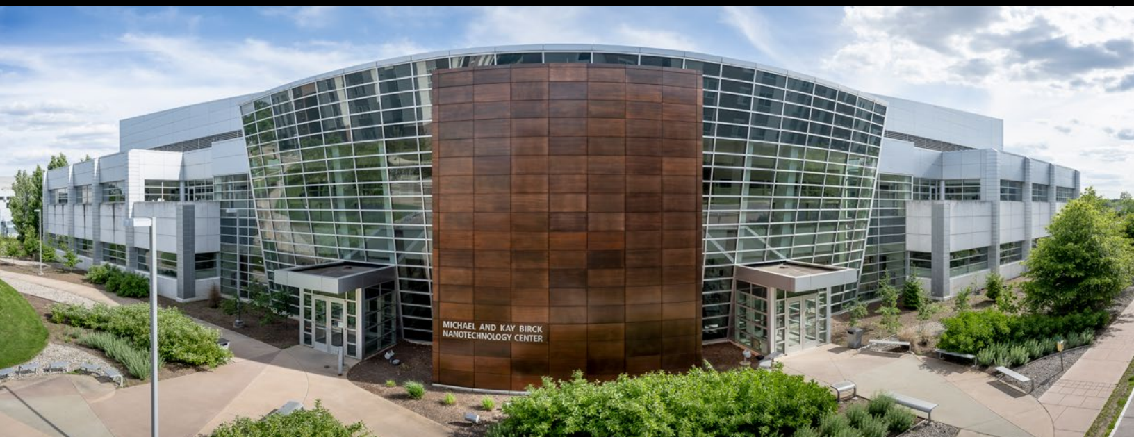
ABOVE: Exterior of Birck Nanotechnology Center; RIGHT: Graduate research assistant working at a cryogenic probe station.